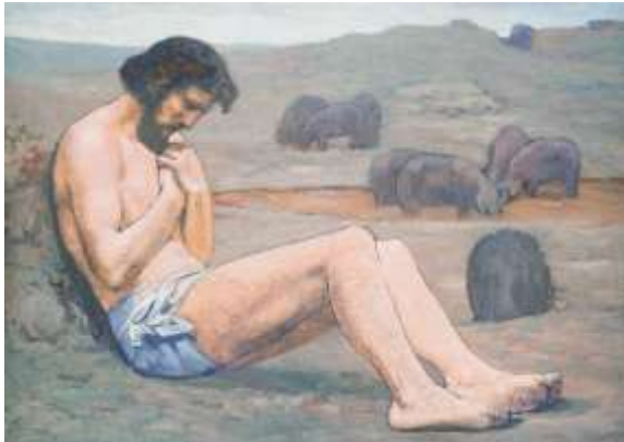
(Artist: Pierre Puvis de Chavannes Date: 1879)

He has forsaken his treasures. He has forsaken his wealth. He has forsaken paradise. He has taken refuse in hell. Are you that forsaken soul! O mortal!