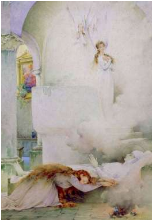
(Artist: Guillaume Dubufe Date: 1853-1909)

He has quit his soul. He has abandoned his spirit. Does such a person actually hide in my being?