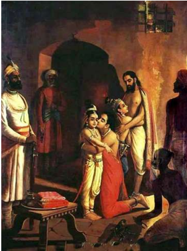
(Artist: Raja Ravi Varma Date: 1848-1906)

He hankers for the throne that does not endure. He hankers for the kingdom that does not endure. Are thou that soul! O mortal!